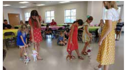
Children enjoy the Family Formation kickoff in 2021.

There is no better place to be formed in the faith than in the domestic church — through daily life in the home with one's family. The family is the primary influence in children's lives and, naturally, learning the faith begins here. At St. Jude, we support families in this mission through Family Formation, a program that just concluded its second year at the parish.